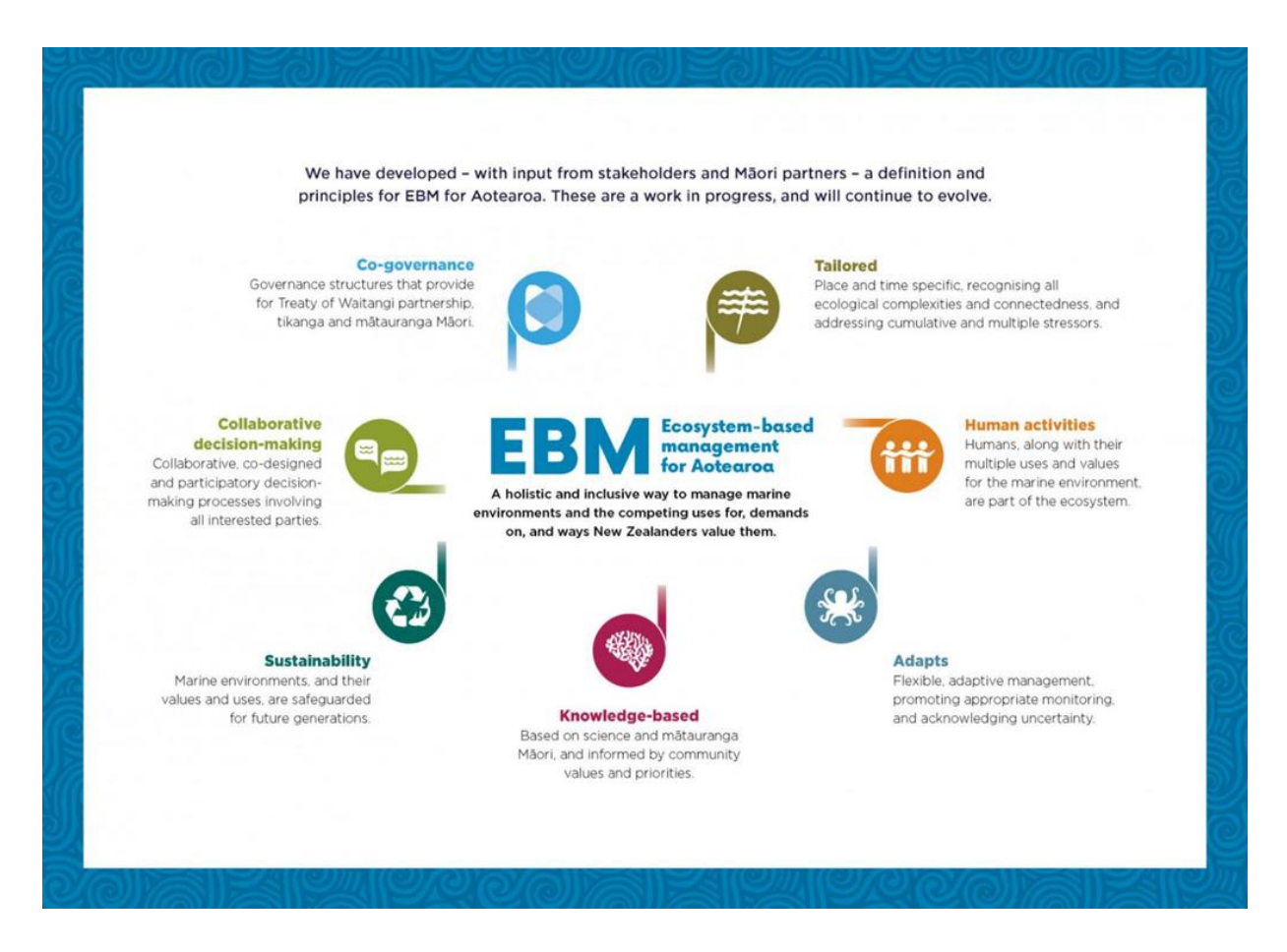
Figure 1: The Sustainable Seas National Science Challenge's conceptualisation of EBM for Aotearoa.

These principles, the definition, objective, and mission were developed with input from stakeholders and Māori partners. The Challenge referred to the EBM concept as a work in progress which was anticipated to evolve (Hewitt et al. 2018).