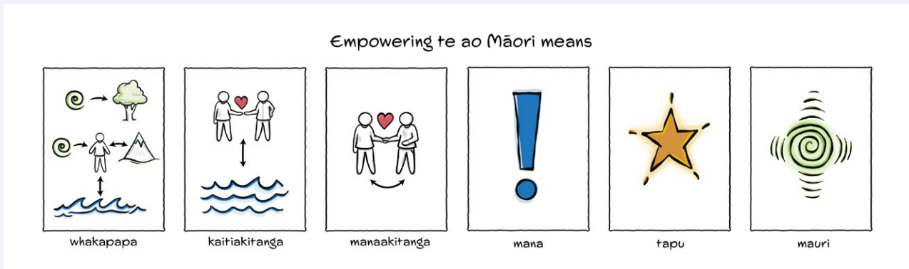
Figure 4 Empowering te ao Māori